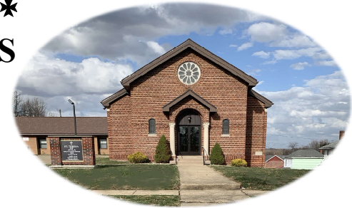
St. Teresa of Avila Cadiz