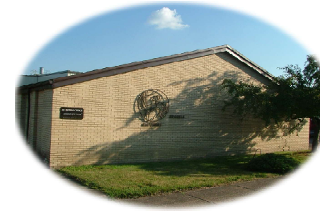
St. Matthias Freeport